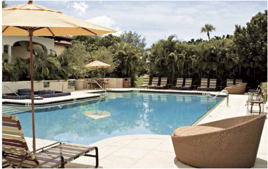
Elegant swimming pools are attractive features at marinas but can significantly add to the slip fees.